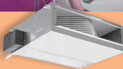
42DW / 42EM False ceiling