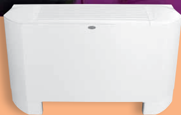
42N Floor and under-ceiling