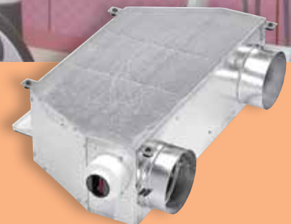
42BJ / 42GR Suspended ceiling